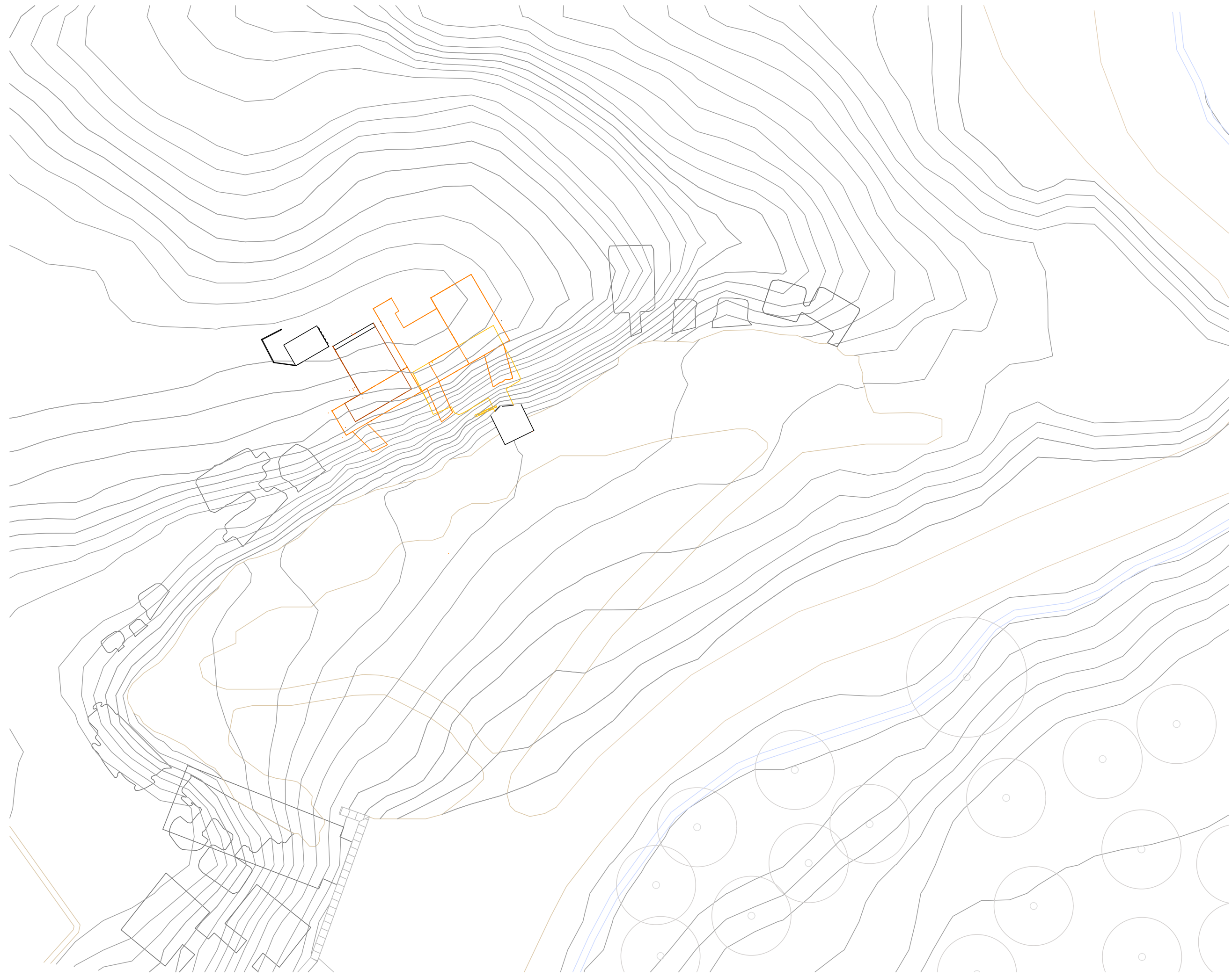
PLANO DE SITUACIÓN