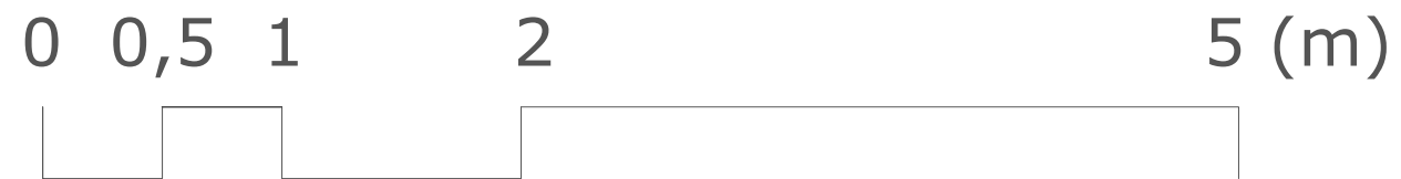
DETALLE DEL TRAMO